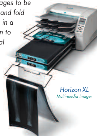
Horizon XL Multi-media Imager

Today's only digital long film imager, Horizon XL instantly delivers true-size diagnostic film for templating conveniently in the OR. Adding value and convenience for the orthopaedic surgeon, the images that document the procedure can be printed and verified before the patient leaves. Our 14" x 36" and 14" x 51" long film allows 'true-size' images to be printed on one continuous film, and fold to 14" x 17" to fit conveniently in a standard film jacket. In addition to long film, the XL prints on several other sizes of film, grayscale paper and color paper, covering all of your orthopaedic print needs in one compact device.